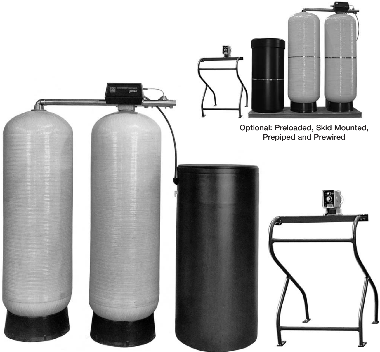
Optional: Preloaded, Skid Mounted, Prepiped and Prewired

For Commercial / Industrial Applications Such As